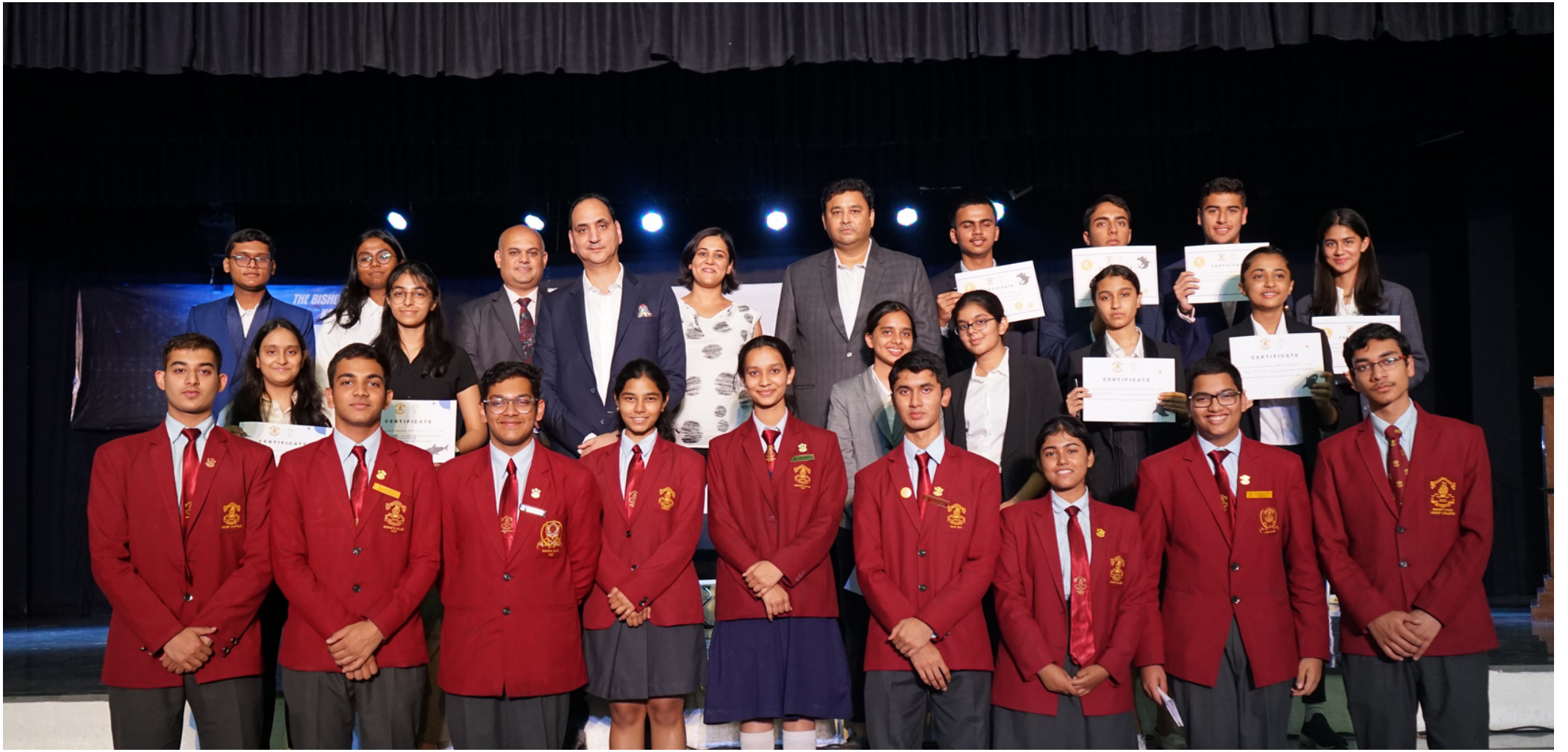
Pictures from the B.E.C'S BISHOP'S SHARK TANK, conducted in December.